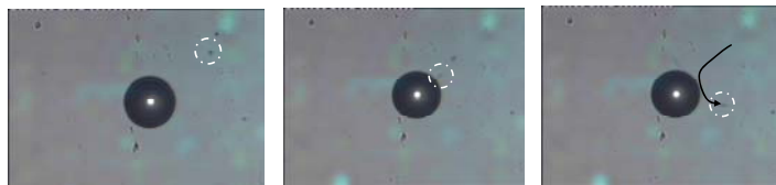
Fig. 2: An example of acoustic streaming causing a 2 micron particle to follow the curved trajectory marked by the black arrow. This sequence of images covers 1.24 secs. In this case the streaming is induced by a 25 micron diameter bubble in an ultrasonic field.